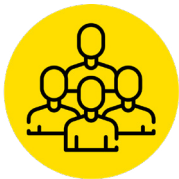
Size of Business (# of staff)